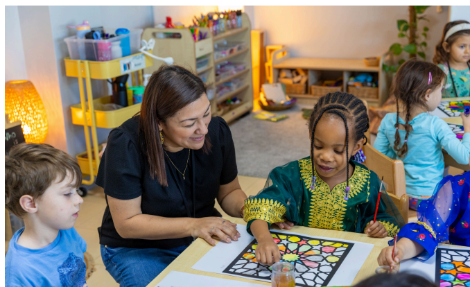
American School of Doha - 6